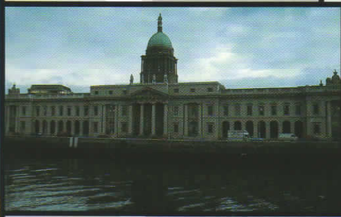
▲ CUSTOM HOUSE (Dublin)