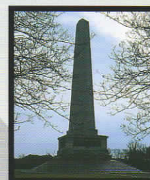
WELLINGTON MONUMENT (Phoenix Park - O.P.W.)