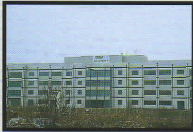
T.E.A.M. BUILDING - AER LINGUS (Dublin Airport)