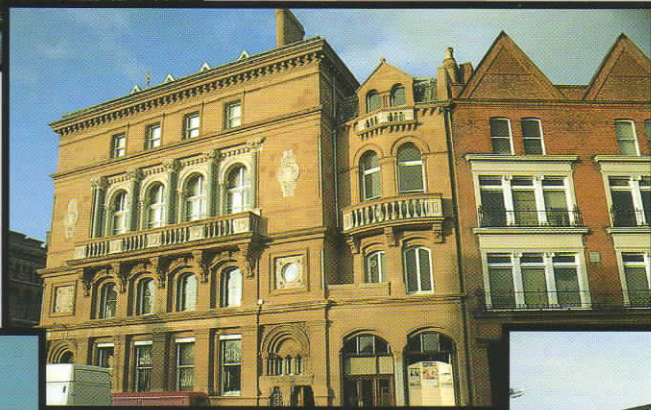
▼ A.I.B. (College Street, Dublin)