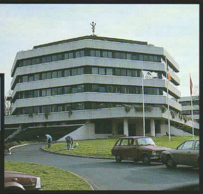
▲ BLACKROCK CLINIC (Dublin)