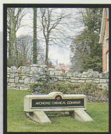
AVONDALE CHEMICALS (Rathdrum, Co. Wicklow)