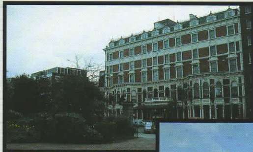
▲ SHELBOURNE HOTEL (Dublin)