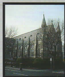
ST. KEVIN'S CHURCH (Harrington Street, Dublin)