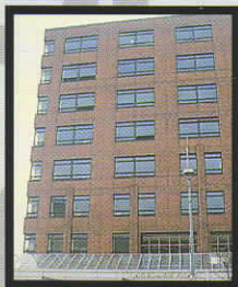
A.I.B. - COMPUTER CENTRE (Adelaide Road, Dublin)