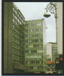
HAWKINS HOUSE (Dublin - O.P.W.)

For further information please feel free to contact us at the address overleaf.